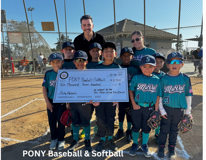
PONY Baseball & Softball