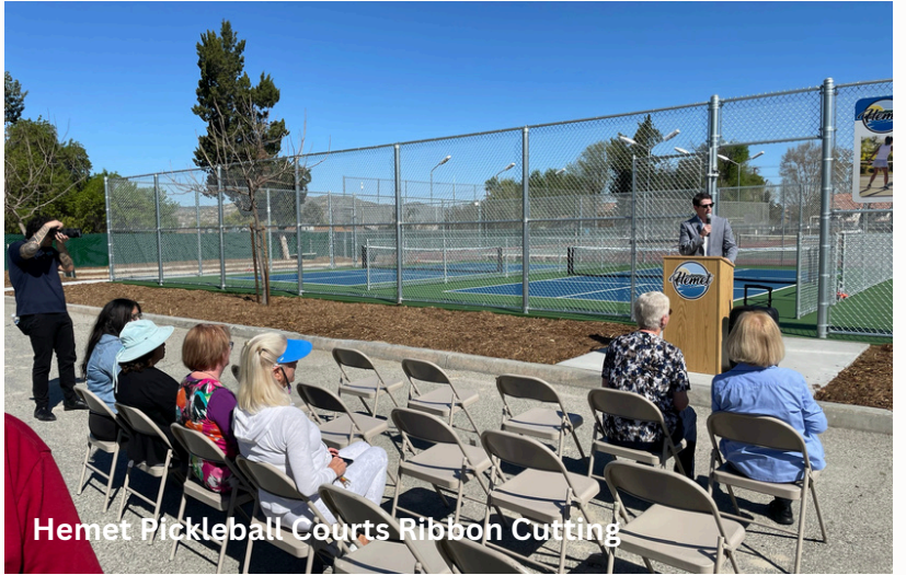
Hemet Pickleball Courts Ribbon Cutting