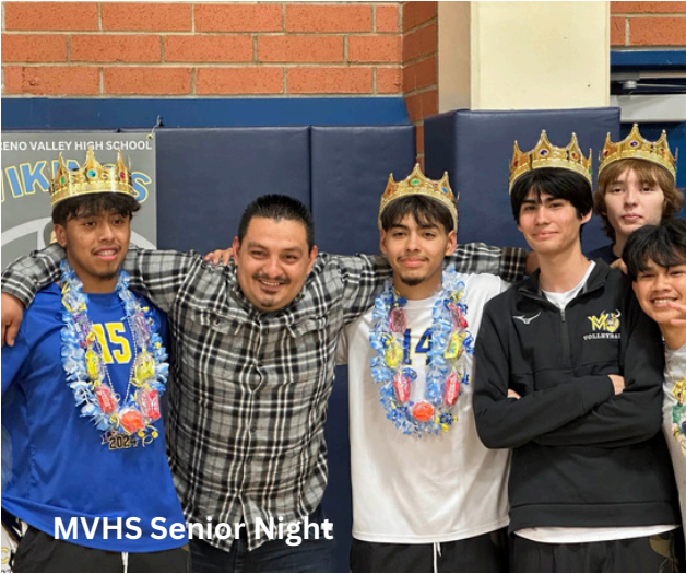
MVHS Senior Night