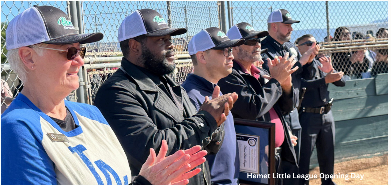
Hemet Little League Opening Day