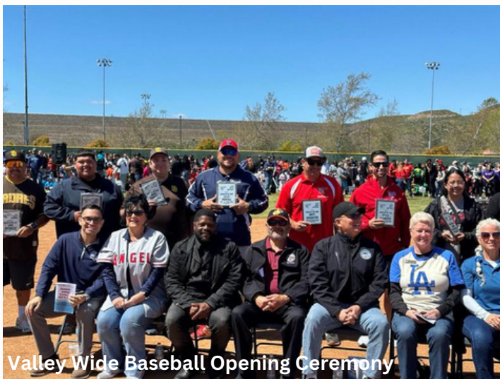
Valley Wide Baseball Opening Ceremony