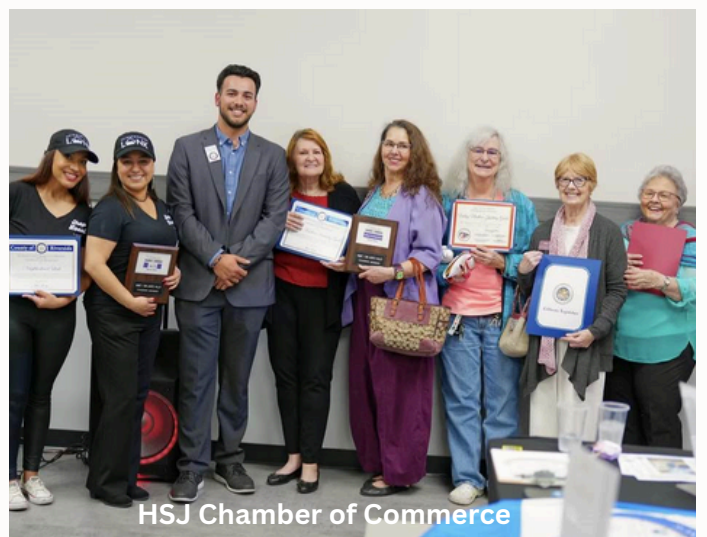
HSJ Chamber of Commerce