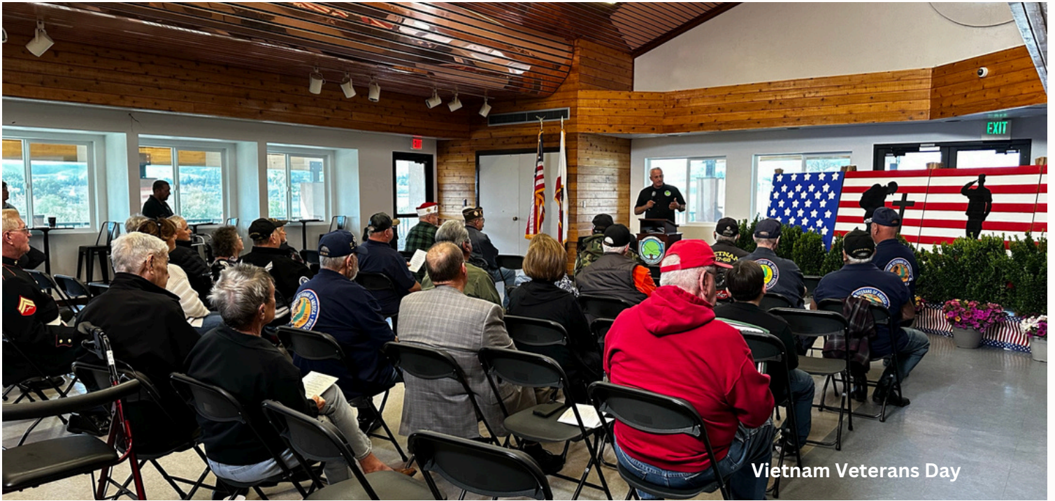
Vietnam Veterans Day