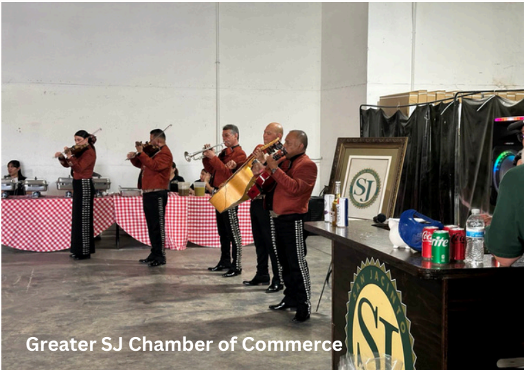
Greater SJ Chamber of Commerce