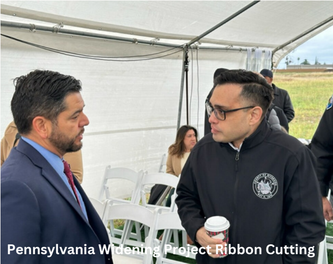
Pennsylvania Widening Project Ribbon Cutting