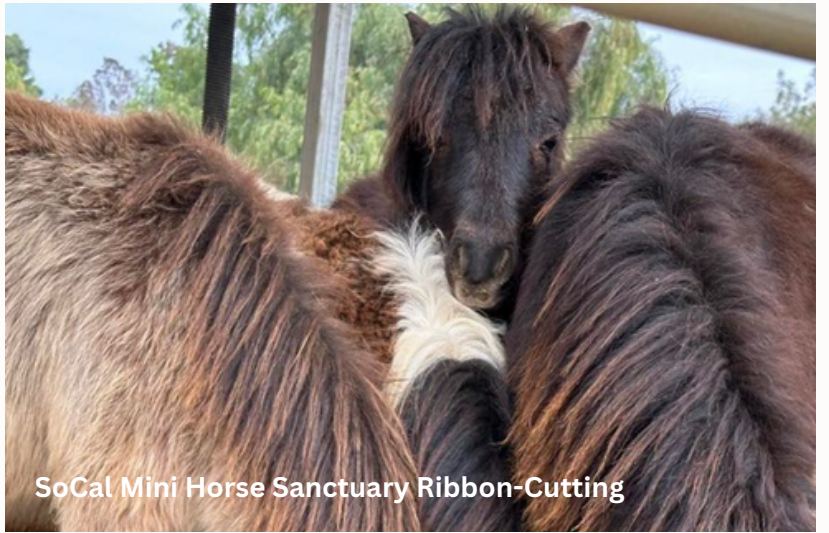
SoCal Mini Horse Sanctuary Ribbon-Cutting