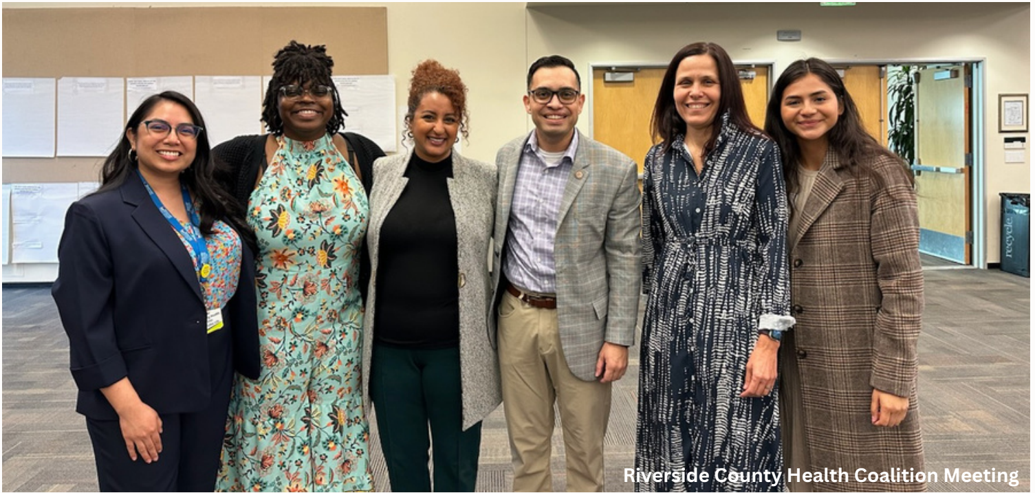
Riverside County Health Coalition Meeting