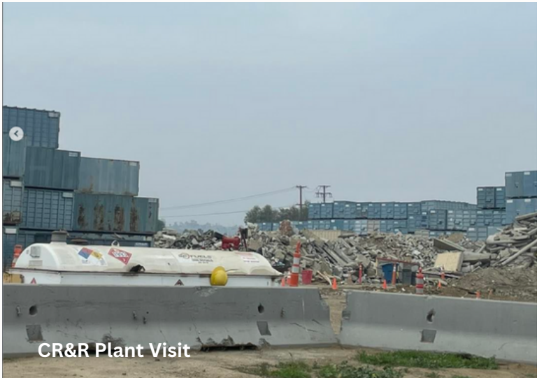
CR&R Plant Visit