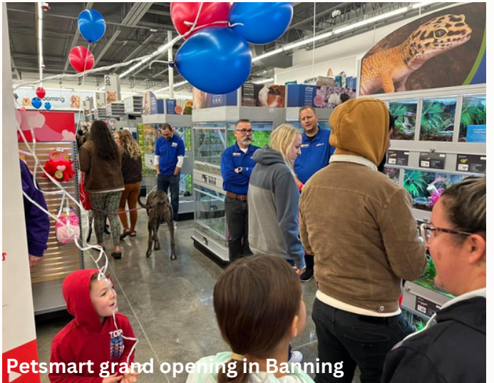
Petsmart grand opening in Banning