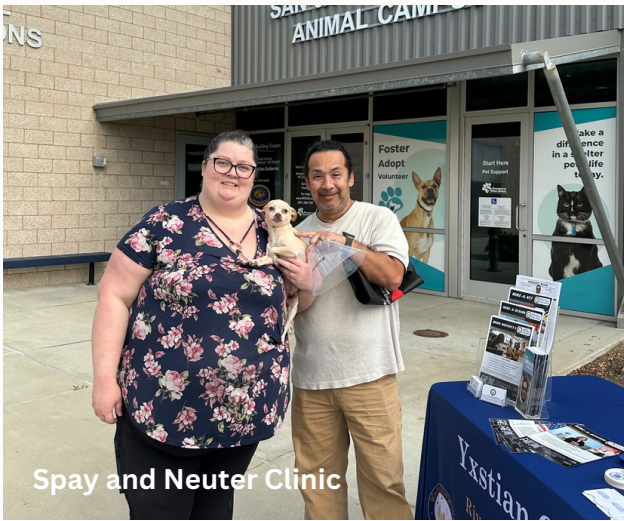
Spay and Neuter Clinic