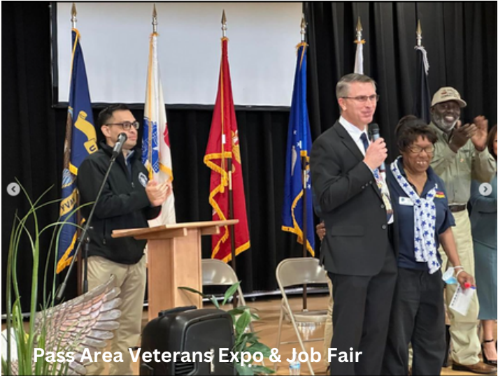
Pass Area Veterans Expo & Job Fair