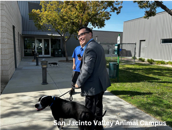
San Jacinto Valley Animal Campus