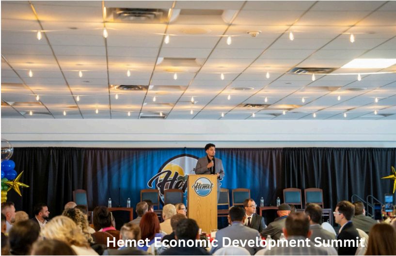
Hemet Economic Development Summit