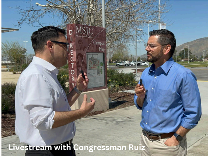
Livestream with Congressman Ruiz