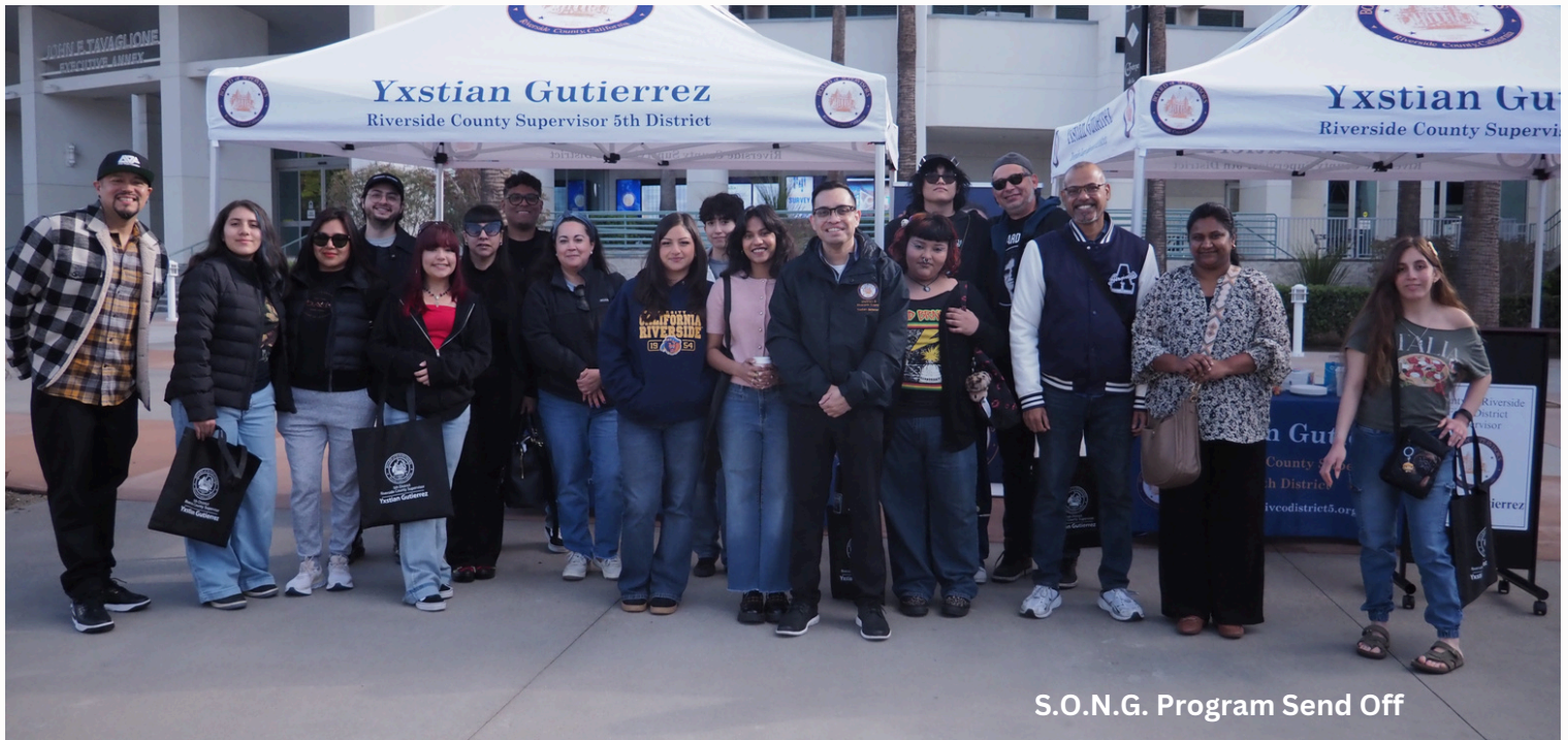
S.O.N.G. Program Send Off