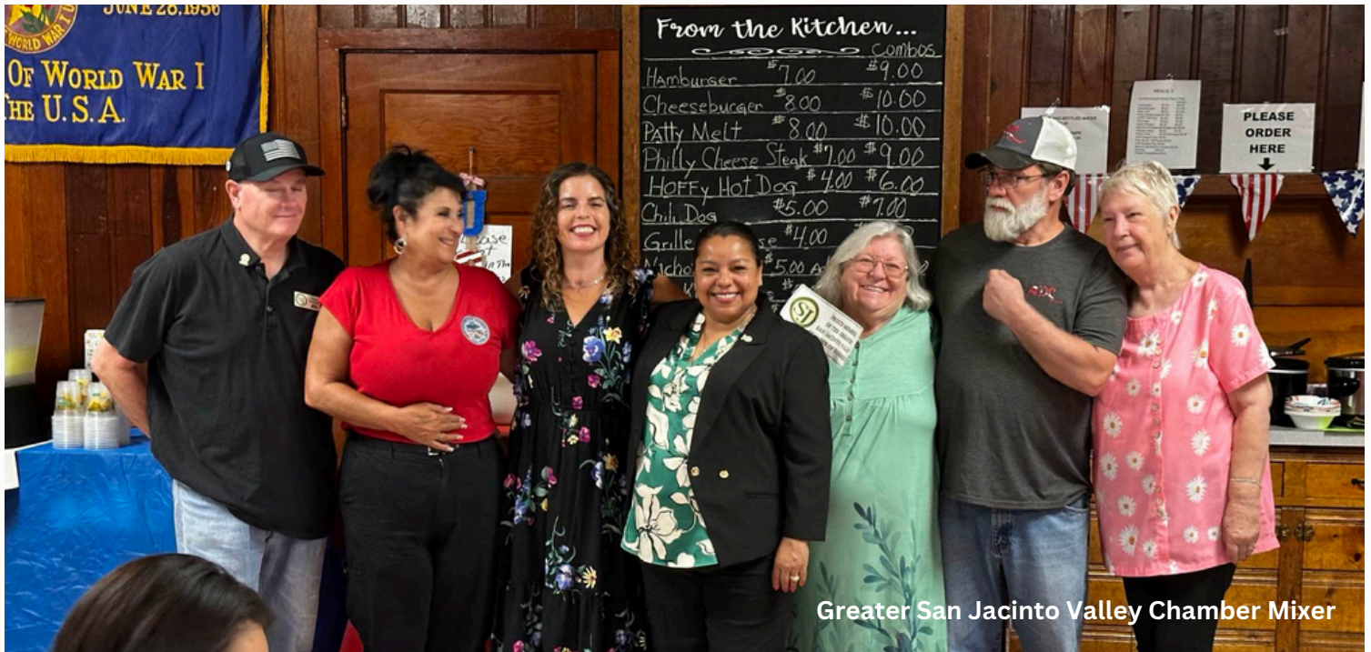
Greater San Jacinto Valley Chamber Mixer