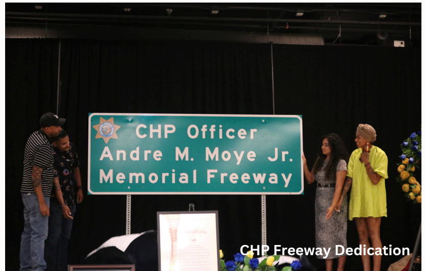
CHP Freeway Dedication