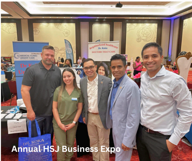
Annual HSJ Business Expo