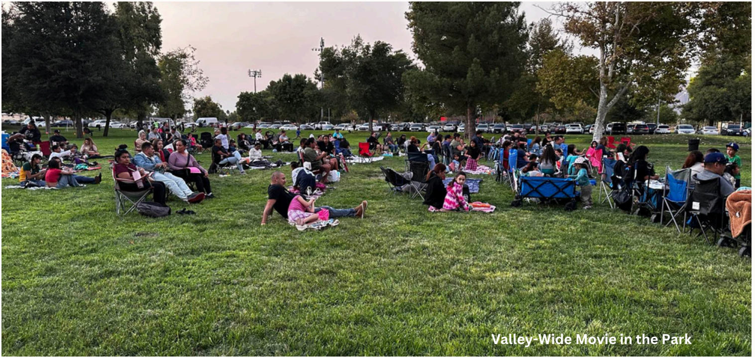
Valley-Wide Movie in the Park